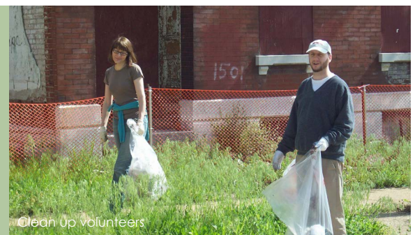
Clean Up Volunteers

Local volunteers clean and beautify streets of historic downtown St. Charles.