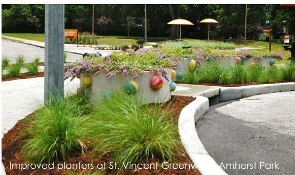
Improved planters at St. Vincent Greenway, Amherst Park