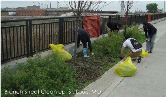
Branch Street Clean Up, St. Louis, MO

City of St. Louis Sustainable Neighborhood Initiative